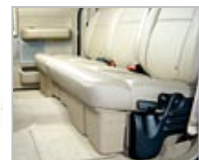
This is how the DU-HA should look installed under the back seat.