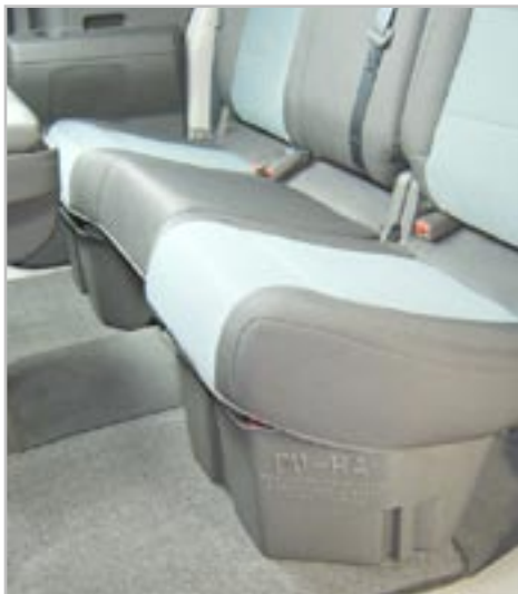
This is how the DU-HA should look installed under the back seat.

For further instructions refer to truck owners manual or contact DU-HA, Inc.