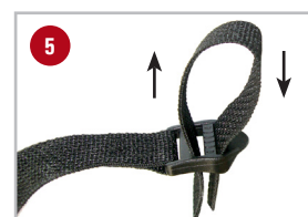
Ribs on buckle should face up. Thread strap through buckle as shown.