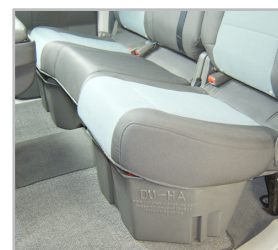
This is how the DU-HA should look installed under the back seat.