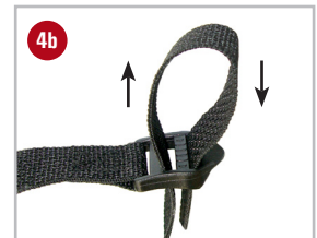
Ribs on buckle should face up. Thread strap through buckle as shown.