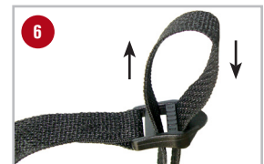
Ribs on buckle should face up. Thread strap through buckle as shown.