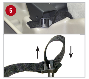
Ribs on buckle should face up. Thread strap through buckle as shown.