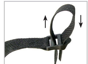
Ribs on buckle should face up. Thread strap through buckle as shown.